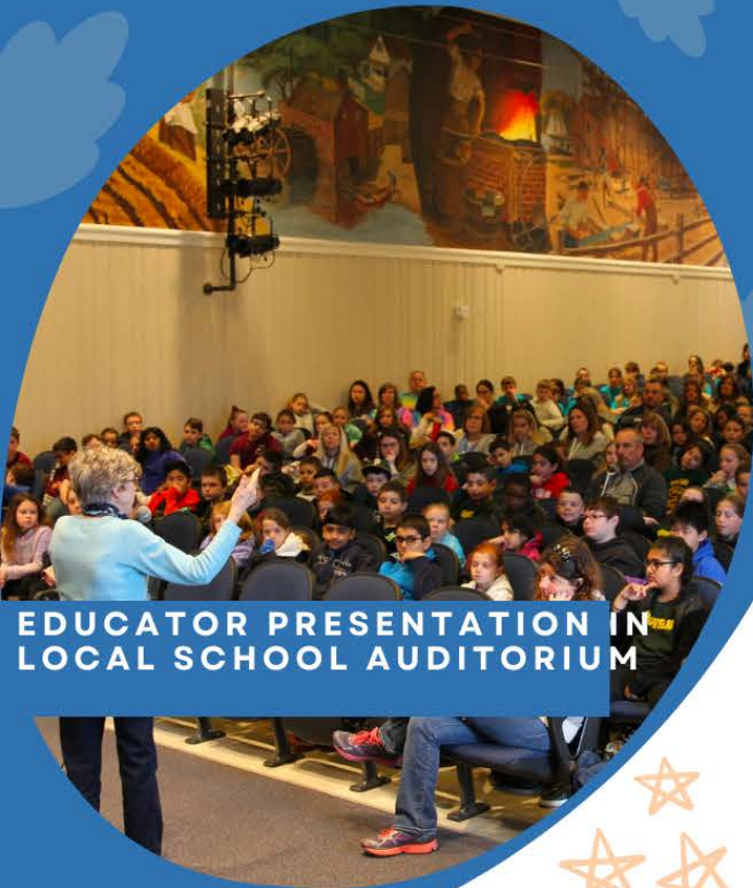
EDUCATOR PRESENTATION IN LOCAL SCHOOL AUDITORIUM