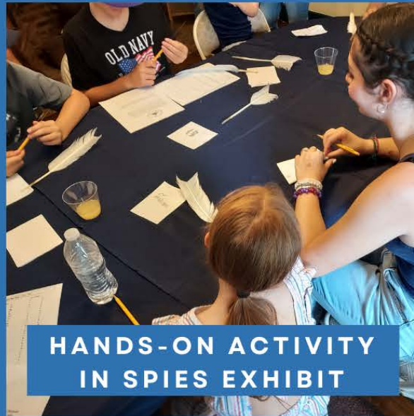
HANDS-ON ACTIVITY IN SPIES EXHIBIT