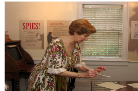
Costumed interpreters give tours of the SPIES! exhibit

The Bayles-Swezey House of Setauket nostalgically overlooks North Country Road. This two and one half story side gable farmhouse represents the rich heritage of Long Island's sister industries of agriculture and maritime shipping. Upon first glance the restored structure and property tells of an agrarian life here in Setauket.