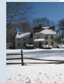
Winter at the Bayles-Swezey House