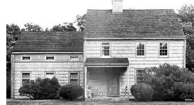
Early spring, date unknown.