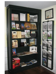
The gift shop offers a variety of books for both young and old, t-shirts, historical toys, and more.

Additionally, a gift shop and exhibit operates out of the house, which is open to the public.